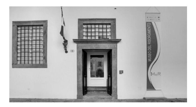
Fig. 7.1. The main entrance of the Lucca Museum of the Risorgimento.

The origins of the Lucca Museum of the Risorgimento can be traced back to shortly after the end of World War I when the Lucca Provincial Veteran's Federation began collecting materials documenting the local community's role in the process of the unification of Italy. The Risorgimento is the historical period dating to the eighteenth century that led to the formation of the state of Italy. At that time, Italy saw the diffusion of the ideals of the French Revolution, the abolition of the old absolutist states, and the formation of new broader organisations, all of which favoured the birth of a new political class and national cultural sentiment.