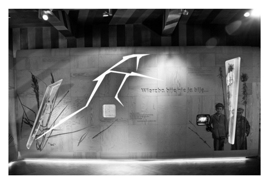
Fig. 9.2. Easter palms, in the "Re-newal" exhibition, Kraków (2011).

Printed on the wall, like water reed pollen flying in the wind, were the names of the plants from which Easter palms were commonly built in Poland in the late nineteenth century and early twentieth century. A modest cross, made from hazel and willow sticks that originated from an Easter palm blessed in church on Palm Sunday protects sown fields against destruction by lightning.