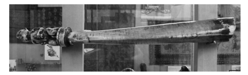
Fig. 15.3. Horn ( trublja ) collected by Dragutin Lerman, on display at the Ethnographic Museum Zagreb.

Reconstructing non-Western art history remains pertinent today, as Western museums are treasuries of the art history of other cultures. Yet, objects often continue to be presented as aesthetic and "timeless," without mention of a date of manufacture on the labels. This practice persists because many items were collected without documentation. Museum records frequently lack information about where, when, or how they were made; it is also unknown if objects were actually used. Because style changes are recognisable, however, artwork can be dated approximately by comparing it with similar objects which have collection histories. Furthermore, the scattering of this material throughout Western museums is a history of its own, which has now become more interesting.