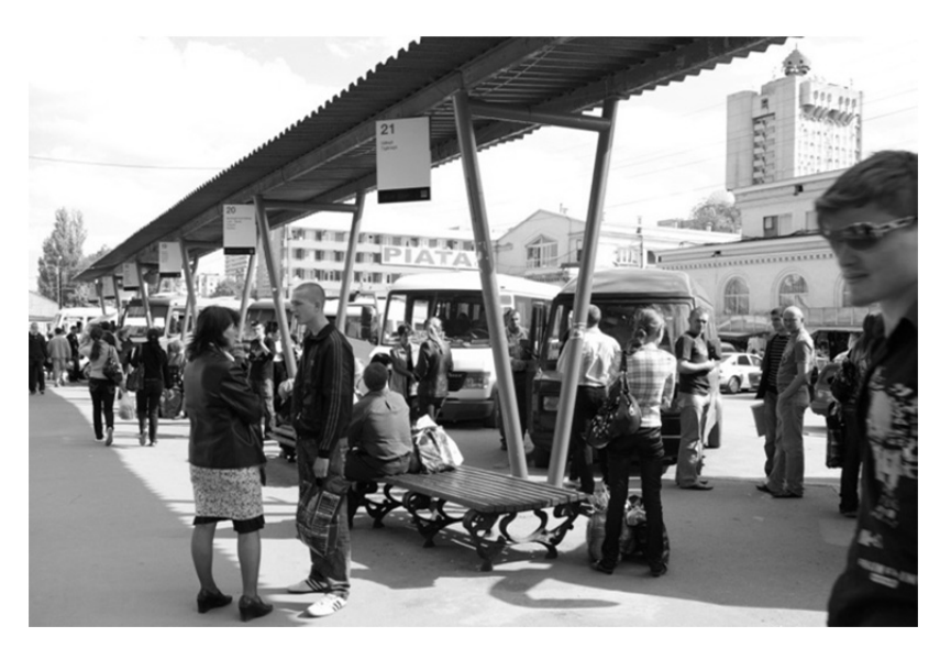
Fig. 14.1. Bus station Chişinău (2009).

More than two kilometres of cables had to be installed to transform the micro-bus into a multimedia exhibition space. Audio stations presented interviews collected during various ethnological field researches in Moldova. Visitors listened to the original recordings in Moldovan (Romanian) or Russian. Additionally, a German translation was provided.