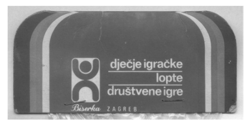
Fig. 4.2. One of several types of toy packaging from the "Biserka" Factory. (from the collection of the Museum of Childhood).

Within the large collection of toys of the Museum of Childhood is a Mickey Mouse rubber toy (Fig. 4.1). It is one of the eleven different models of rubber Mickey Mouse toys produced at the "Biserka" Factory in Zagreb (Fig. 4.2). The factory, established in 1956, specialised in the production of toys, games, and balls. As a result of the Civil War in the 1990s and post-war events, the factory has stopped working. Thus, the possibility of reconstructing relevant data, which would ideally come from the source itself, was inevitably made more difficult.