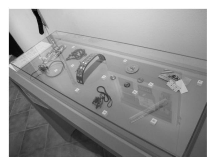
Fig. 6.3. Personal items collected from youngsters in Pazin, detail from the exhibition Odakle smo/Di dove siamo (2013).

workshop leaders tried to emphasise that ICH is about not just the way of life of our ancestors, but also today and us. During the workshop, students were consequently encouraged to think about what is important to them and to look into their own living traditions and the relevant cultural elements of their everyday lives.