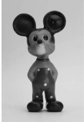
Fig. 4.1. Mickey Mouse rubber toy, on the left in the condition when found at the flea market. Production: "Biserka" Factory, Zagreb, SFR Yugoslavia, 1968, product number 155. (from the Collection of the Museum of Childhood).