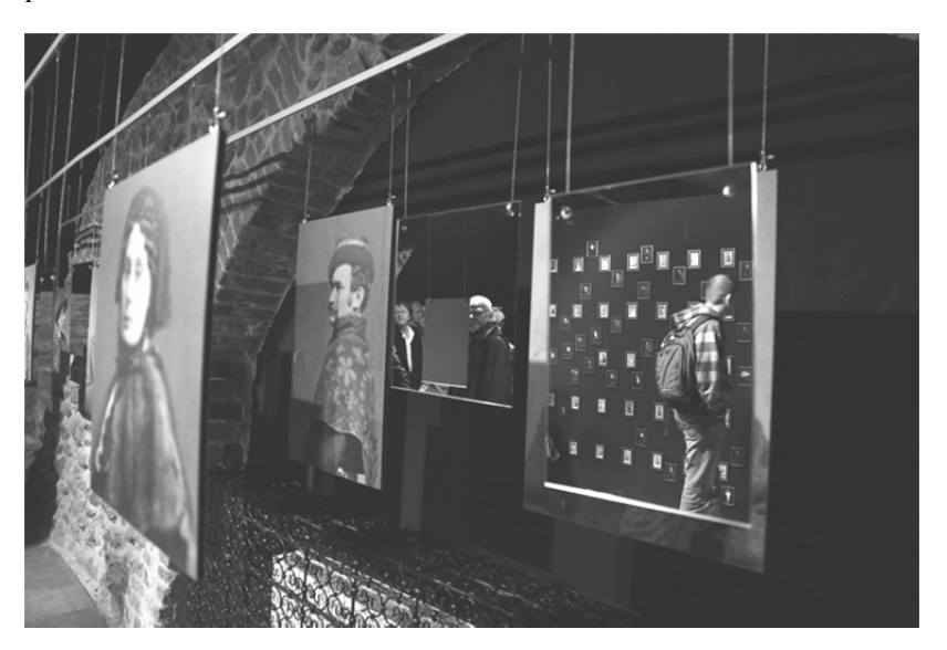
Fig. 9.5. "Transmissions," "Passages and Returns" exhibition, Kraków (2011).

"Transmissions" presented photographed portraits of people from Małopolska from a hundred years ago, and mirrors in which visitors could see their reflection. These are the people who created and used the things on display. Standing in front of them or nearby, visitors could ask themselves, "Is there a thread that connects us?" "Can we, in our contemporary times, standing next to them, be portrayed in the same poses?"