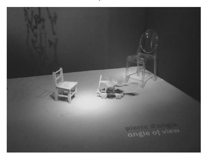
Fig. 9.3. "Angle of View," "Passages and Returns" exhibition. Marseilles (2011).

Therefore, the goal was for the audience to evoke in themselves the often forgotten child who carefully looks, examines, and discovers. They would see their reflection in the faces of others. They would experience, go through, and arouse the reflections in themselves. At the same time, the linearity of the exhibition was left behind. Nothing was imposed, no "sightseeing directions" were suggested; the viewer was given the choice of which way they would like to direct their steps. But the expectations of those who did not necessarily want to follow their own path were also considered. The opportunity to follow their own footsteps by looking into a specially designed folder which explained curatorial choices and gave information about the artefacts was provided.