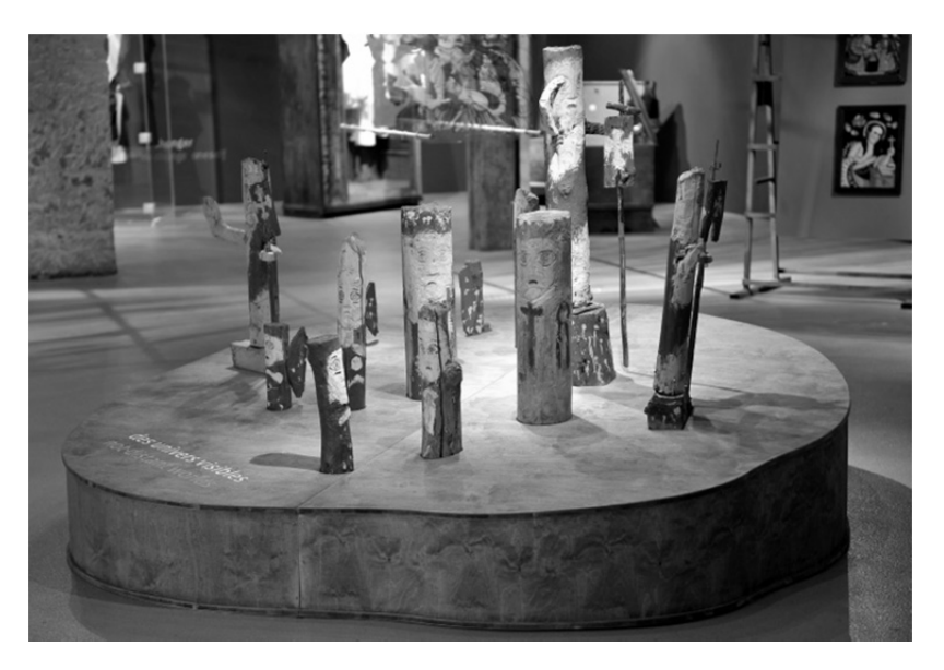
Fig. 9.4. "Non-distant Worlds," sculptures by Heródek, Karol Wójciak (1892–1971). "Passages and Returns" exhibition, Marseilles (2011).

A wardrobe painted in an almost comic story, a glass wardrobe, the deconstruction of a wardrobe, and dowry chests of solid wood with locks and keys are at the centre of "Get Changed." In their interiors were elements of peasant festive costumes from the start of the twentieth century including men's jackets of heavy cloth, white shirts forming a snowy surface, and women's corsets with attached pouches resembling coral reefs. Here, visitors were encouraged not only to try on contemporary regional costumes used on festive occasions by the highlanders from Podhale, but also "change" their thinking about things. Is a costume a sign, fashion, custom or rather the interplay of colours, the beauty of design, and a work of art?