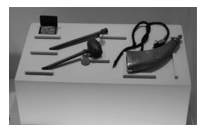
Fig. 7.7. Objects on display. (authors' photograph).