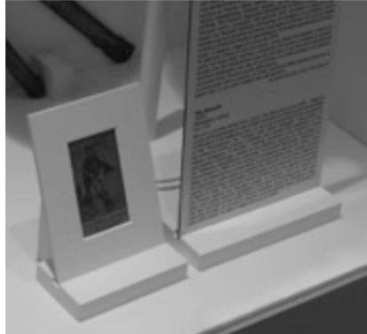
Figs. 7.5 (left) and 7.6 (right). Mounting techniques of drawings and documents.