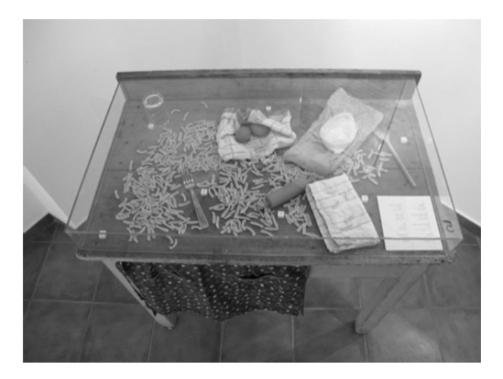
Fig. 6.4. Kitchen table with ingredients for making šurlice , a typical local pasta, from the exhibition Odakle smo/Di dove siamo (2013).

Students also questioned if objects and gestures charged with strong symbolic meaning are taken consciously or these are somehow imposed and mediated by other social processes. Immersion in musical preferences, youth trends, and fashion showed an intergenerational picture about how these aspects of daily life reflect on groups and individuals. The students' focus was pointed to individual and group identity and life philosophies and social relationships in the context of musical preferences, youth fashion, and trends, such as where they hang out, movies they like, and other popular culture amongst youngsters, in general. Food stories described the preparation, consumption, and social moments of traditional foods in families not originally from Istria. These stories also explored the background of a traditional type of pasta and why it has disappeared from our tables. Change in traditions was illustrated by the narratives of how and when typical ravioli was prepared in the past in comparison to how it is prepared and consumed today.