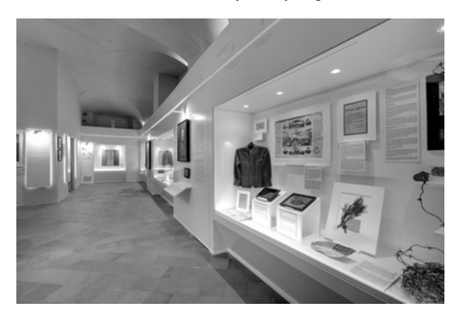
Fig. 7.2. The main gallery of the Lucca Museum of the Risorgimento. (photograph courtesy of the Provincia of Lucca).

Italian state. A selection of historical and literary quotes helps to evoke the "spirit of the time." The visitor inserts themselves into this orderly and comfortable environment in which they freely explore the museum.