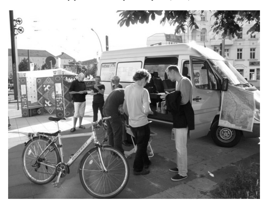
Fig. 14.6. Dialogue in Berlin-Pankow (2010). (© Beate Wild).

He or she may react defensively when confronted with an exhibition in an unexpected location. For example, we observed that visitors were reluctant to enter an exhibition installed in a van, although objects presented outside of the vehicle caught their attention. Michael Pfaffenthaler offers an interesting explanation, arguing that the interior of a vehicle is usually perceived as a private space (2013).