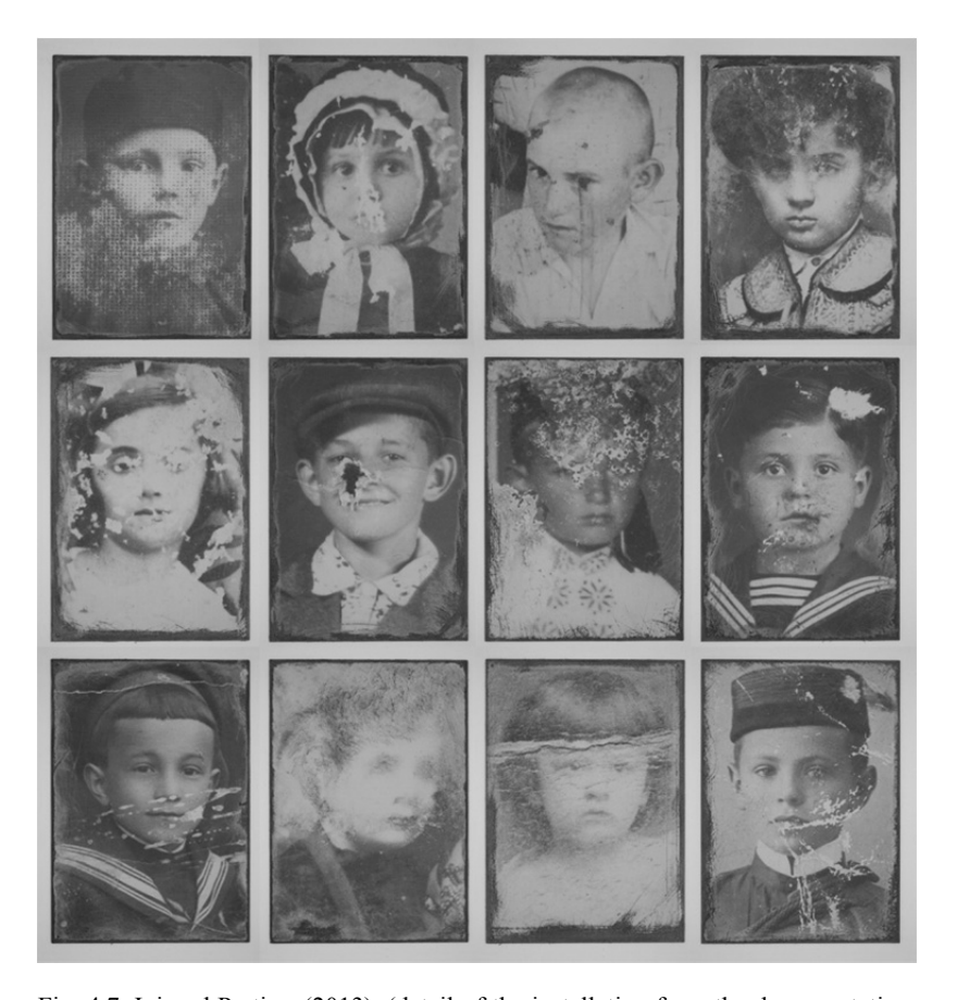
Fig. 4.7. Injured Parties. (2013), (detail of the installation from the documentation of the Museum of Childhood).

The installation considered the relationship between appearance and disappearance, not just of photographs as documents of meaningful moments in history, but also the fracture of memories, concepts, and fragments of the past which had faded for different reasons. In such a situation, where sites of discontinuity and voids in the archive and memory had been created, recollecting and rearticulating the abandoned documents otherwise disconnected from either private or collective historical narratives create a field of new historical configurations and manipulations. Any archive is a product of the social processes and