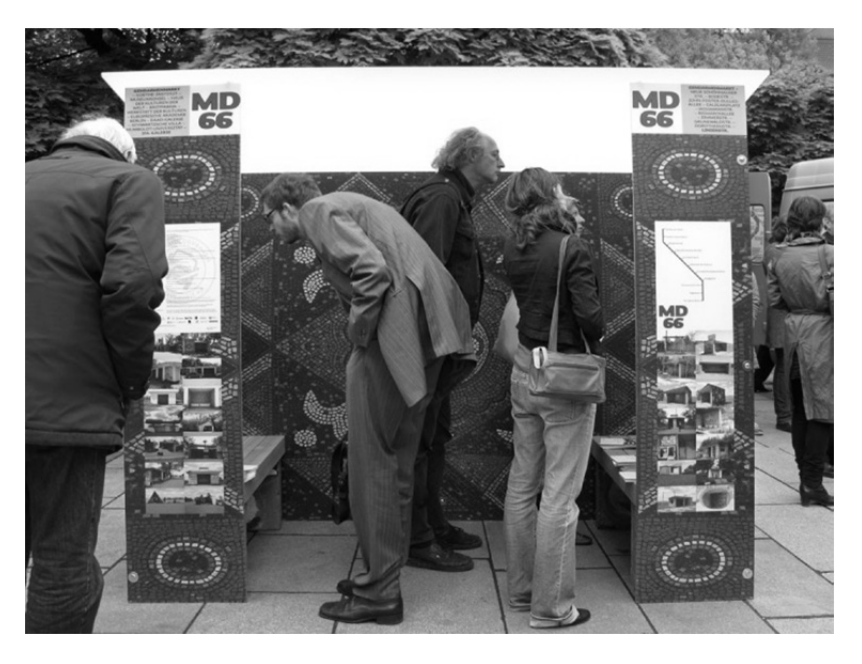
Fig. 14. 2. Bus shelter in Berlin (2010).

The tour continued to Leipzig, home of the Moldova Institute, and Mannheim, twinned with Chişinău, capital of Moldova. Finally, the microbus and its technical installations were handed over to the Republic of Moldova and thus made available to local NGOs, enabling them to present their projects to a wider public especially connecting urban and rural spaces. Thus, the circle of dialogue which defined the whole project was complete. With the initial field research, a dialogue in Moldova began which asked citizens to talk about their country, their life in Moldova, their fears, their hopes, their wishes, and their European perspectives. These views and opinions were presented to exhibition visitors in Germany who were engaged in a dialogue about this small and little-known country. The final step of the project continues to seek a longer-term social dialogue while contributing to stimulating a more open and informed democratic society in Moldova.