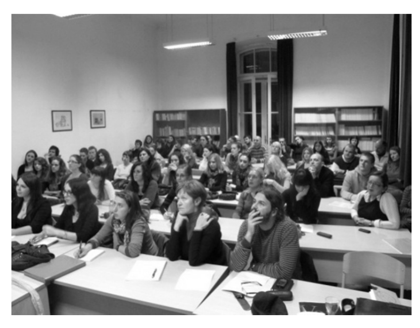
Fig. 6.1. Workshop at Juraj Dobrila University, Pula (2012).

At least two concrete, positive outcomes came from the university workshop. First was a student who chose to elaborate and portray the life history of a man who was a famous local blacksmith using his camera. Afterwards, the student expanded the work and used it as the final project for his graduation thesis. Second, the other group's research topic took the perspective that university students from other parts of Croatia have of the local population based on their first impact experience as "outsiders." Pushed by the workshop mentors to think critically and question socially constructed "truths," the students' research results produced a vibrant Internet discussion. The majority of the informants did not have very positive opinions about the local population. They pointed out the exclusiveness and cold attitudes toward individuals who were not from Istria. Perspectives such as these, however, contradict the dominant political discourse that defines Istria and its citizens as an open multicultural society with a high level of tolerance. The students' text did not try to make pretentious conclusions; they admitted that the lack of deeper research and analysis was evident in the results. Their text, however, sparked a discussion on a few local web portals. The reports by one journalist about the workshop results and the final texts generated