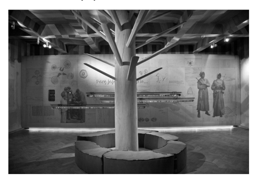
Fig. 9.1. "Re-newal" exhibition in the Seweryn Udziela Ethnographic Museum,Kraków (2011).

Springtime means nature awakened, movement, sounds breaking the silence of winter, and above all, re-creation in the fields, and direct contact with the earth and nature. The gallery was arranged to arouse associations with open spaces outside the house. Walls covered with square, pale-coloured wood panels were intended to produce a compelling memory of the wooden sides of peasant cottages, scrubbed clean white before Easter. The rounded edges of the panels placed visitors outside of the houses. This impression was enhanced by a light-green illumination emanating from the walls, evocative of the ground covered with fresh spring grass, though the floor was still wooden parquet.