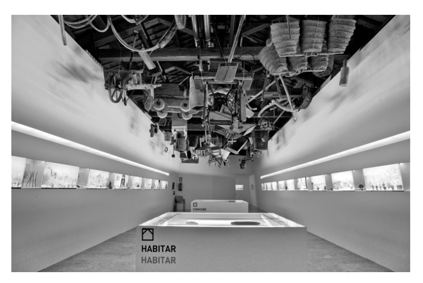
Fig. 8.2. Objects were displayed suspended from the ceiling in the Secà and Muntanya permanent galleries.

After the opening of the Horta y Marjal galleries, funding was received to produce the final section of the project at Muveat: the permanent galleries devoted to traditional culture in the unirrigated ( secà ) and mountainous ( muntanya ) areas of the Valencian country. The main discursive scheme of the four thematic areas used in the other two sections was retained in this exhibition. The original proposal was to retain the same museological planning used in the Horta y Marjal exhibits; the first space was to be mainly scenographic and the second would emphasise artefacts using classic museum displays.