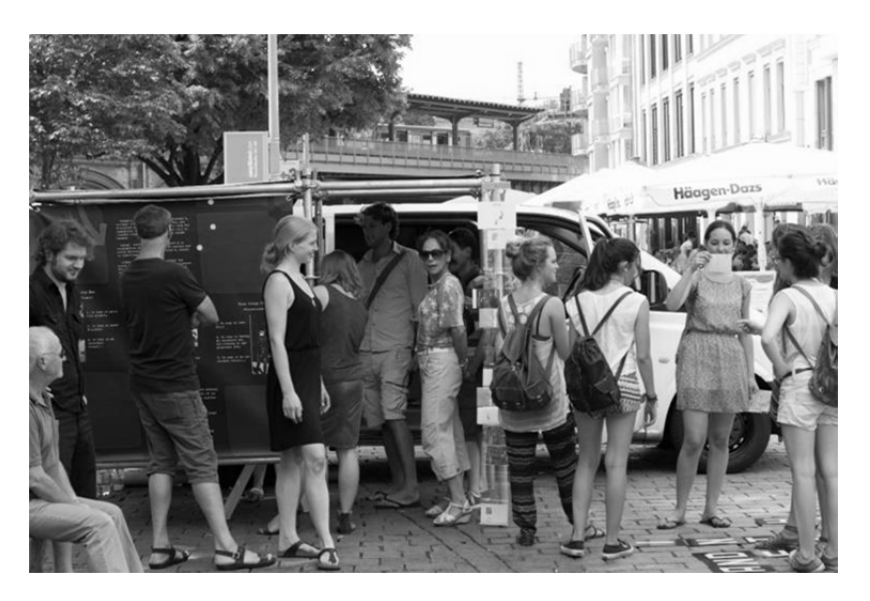
Fig. 14.4. Exhibition in Berlin (2013) (© NIC e.V.).

In cooperation with experts from academia and cultural organisations, students were asked to develop their visions of a European comfort zone. The results of the workshop were presented via different media, among them videos, photos, and audio points, in a mobile exhibition space presented in four European cities from August to September 2013. The aim of Fearful Visions—Visionary Ideas: Europe's Youth on the Move was to give European youth a voice in the public discourse.