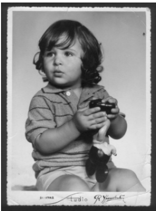
Fig. 4.3. Children with rubber Mickey Mouse toys (from the photo archive of the Museum of Childhood).