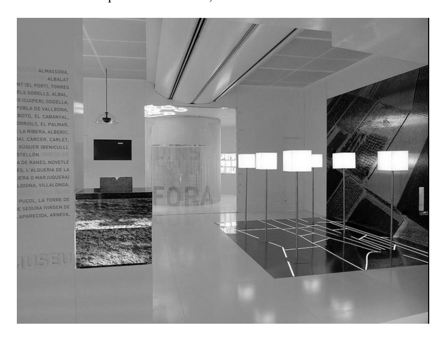
Fig. 8.1. A view of the Horta y Marjal exhibition.

in this room was sought; thus, a different team of designers was chosen. The main idea was to reproduce a museum storage depot. Museological design was based on a row of classical vitrines. Inside, objects related to different aspects of farm work were displayed, primarily emphasising irrigated fields. In addition, a large, long case was used to display objects related to other spheres of rural life, such as beliefs.