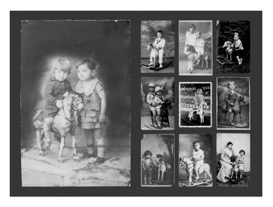
Fig. 4.6. Rocking horses. (2006). "Memories Taken Over." (from the collection of the Museum of Childhood).