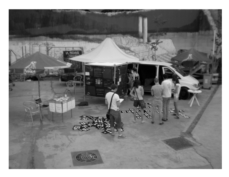
Fig. 14.5. Exhibition in Madrid (2013).

For example, visitors could participate in "The Visionary," a game similar to Scrabble which was developed by the project's participants. Photos documenting participation could be downloaded afterwards from the project blog. Another project, the interactive blog "Positive Participation," invited visitors to take part in a collaborative narrative, which presented a fictional conversation between a sceptic and an enthusiast of the European Union. The experiences from the exhibition and the statements and positions provided by visitors were used as a starting point for discussions with academics, politicians, and artists. Thus, the dialogue was sustained beyond the frame of the project.