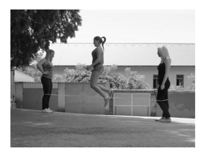
Fig. 6.5. Rubber-band skipping (2014).

The historical overview of Lungomare and its particular features interwoven with personal memories, thoughts, and experiences allowed the students to understand its significance. The etymology of specific place names and infrastructural changes in the area that students explored illustrated social and cultural changes during the last century in Pula. Personal memories that were collected added the human dimension to the place and time, from the period of Italian administration between the two World Wars, through the socialist Yugoslavia era, and since 1991 when Croatia became an independent nation. Other students focused on ordinary daily activities and the way community members have lived and used the space. Examples of everyday life included going to the beach, taking walks, participating in sports, drinking a morning coffee, enjoying the sunset, taking part in an evening party, looking for intimacy with a loved one, or being socially engaged in the preservation of the place. The socialising element, as well as the personal need for leisure moments or physical activity, emerged as constituting a dominant dimension of the place. A variety of micro activities have created a multiplicity of social relations, influenced personal and group identities, and generated habits. They have shaped local particularities, stories, urban myths and legends, and other intangible expressions.