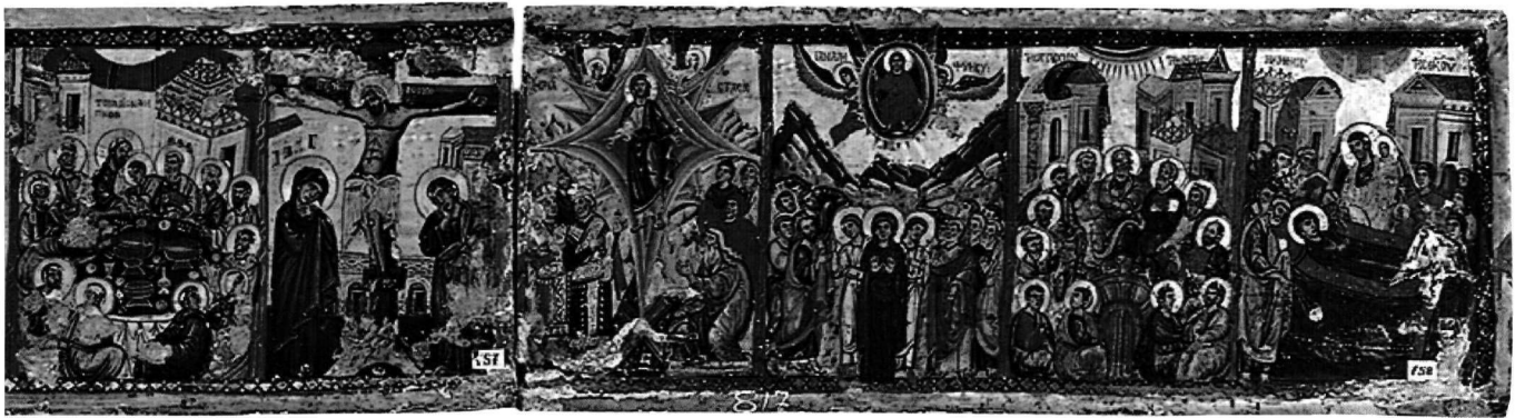
Fig. 2. Iconostasis beam, second half of the thirteenth century. The Holy Monastery of Saint Catherine, Sinai.

conventional representation in which Moses receives the tablets of the law, as it depicts the episode from Exodus which immediately follows that of the vision of the Burning Bush. This relates how Moses removed his shoes in veneration at the holy site and was commanded to return to Egypt to liberate the chosen people and lead them to the Promised Land. As he feared that the task was beyond his powers, God bade him cast his staff onto the ground, where it turned into a serpent, but when Moses grasped the serpent by the tail, it again became a rod (Exodus 3:1-4:17). This staff became Moses' instrument for performing the miracles which enabled the Israelites to escape from Egypt and survive their journey to the Promised Land: as such, it was recognised as the symbol of the mission entrusted to Moses by God beside the Burning Bush.