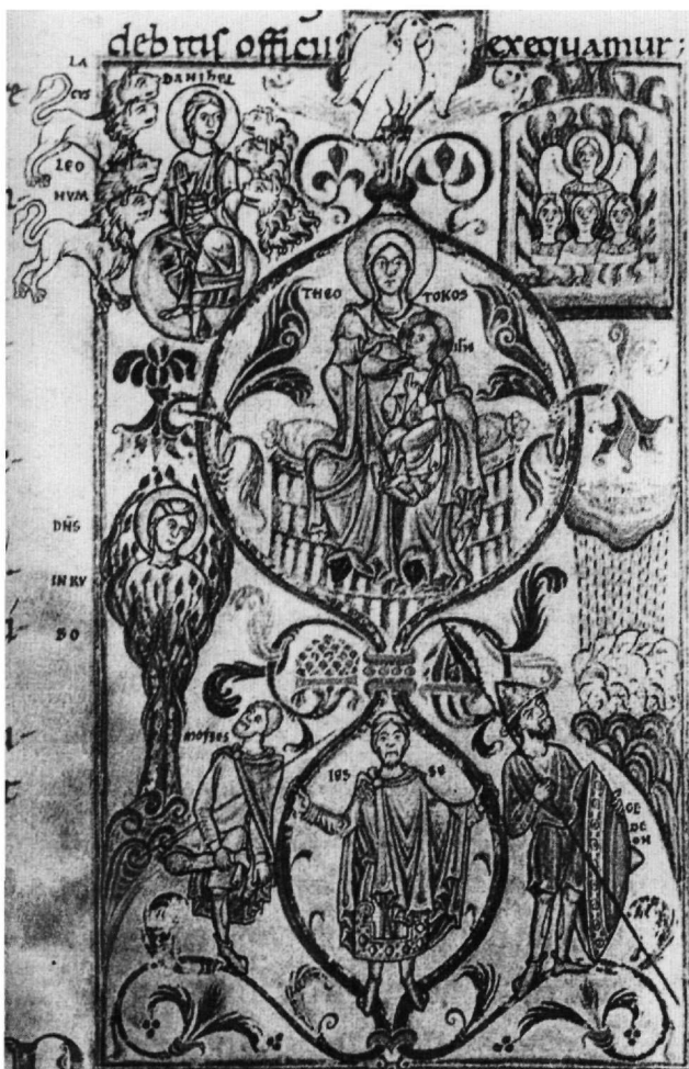
Fig. 3. Citeaux Lectionary MS 641, fol. 40v, c. 1115-25.

scripts such as the Citeaux Lectionary MS 641 (c. 1115-25) (Fig. 3) 41 , the Bible Moralisée MS 270b in the Bodleian Library (second quarter of the thirteenth century) and the