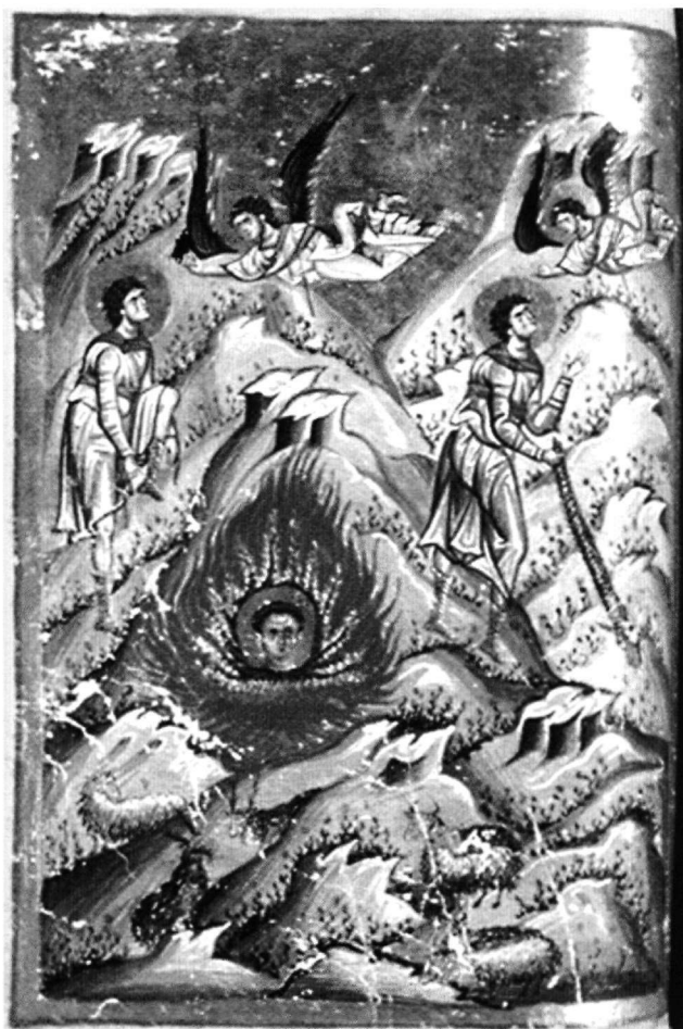
Fig. 4. Homilies of the monk James of Kokkinobaphos, mid-twelfth century, Paris, BN, MS gr. 1208.

1177 47 . If what Thietmar describes was in fact a luxurious metalwork artefact, it seems highly probable that it was