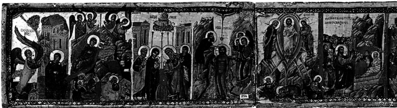
Fig. 1. Iconostasis beam, second half of the thirteenth century. The Holy Monastery of Saint Catherine, Sinai, Egypt.

already been the object of study 36 , but his account of the visit to the chapel of the Burning Bush which preceded the veneration of St Catherine is less familiar but equally valuable. Having noted that the Bush was venerated by both Saracens and Christians, who approached it barefoot, he continues: “the original Bush was taken away and divided up among the Christians for relics, but a gold bush resembling it was made from sheets of gold; on it is a gold figure of the Lord, and on the right of the bush a gold image of Moses who is removing his shoes. Another figure of Moses stands on the left of the bush, as if barefooted, with his shoes removed, in the place where the Lord sent him on his mission to Pharaoh, the ruler of Egypt, to lead away his people” 37 .