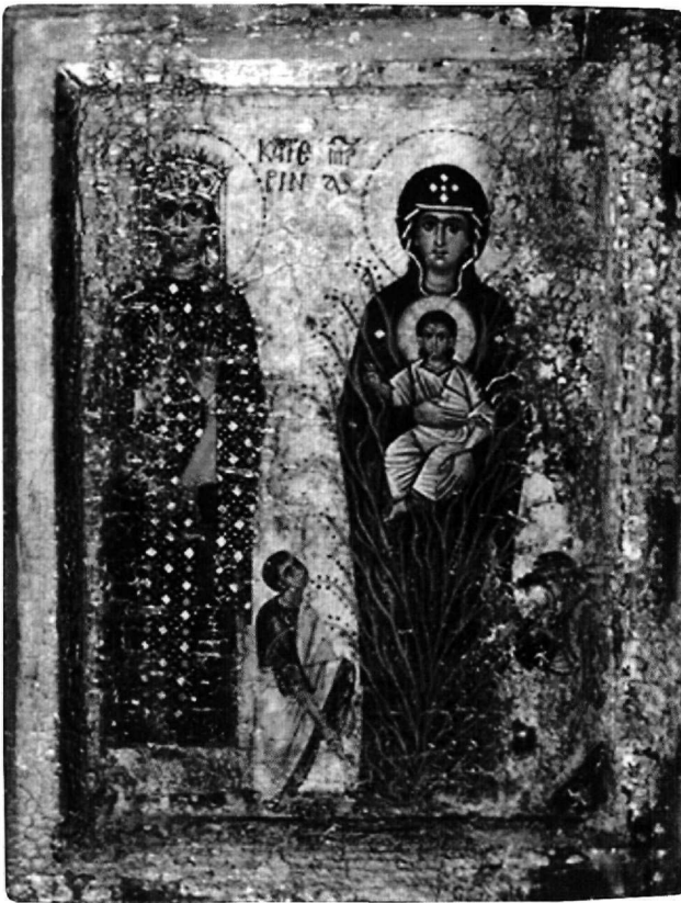
Fig. 5. Icon with St Catherine, the Virgin of the Bush and Moses, second half of the thirteenth century. The Holy Monastery of Saint Catherine, Sinai.

group representation of the sacred figures associated with Sinai (Fig. 5) 52 . St Catherine, in imperial attire, stands on the left, with at her side the Virgin \eta \beta\acute{\alpha}\tau\omicron\varsigma , shooting forth fiery branches and holding the Emmanuel in her arms in front of the flames. The Virgin is flanked by a double image of Moses, who unties his sandals on the left, while on the