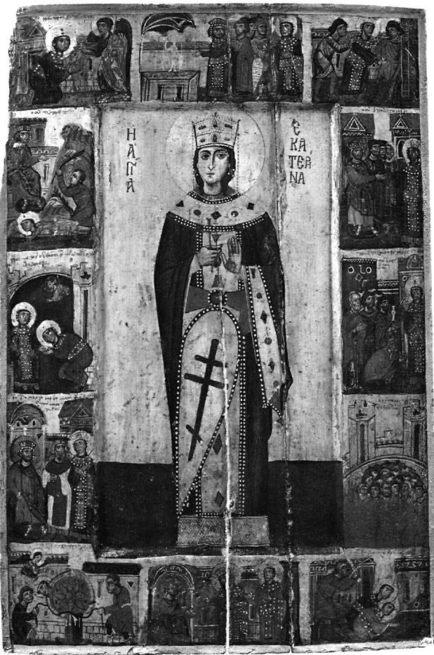
Fig. 8. Icon with Saint Catherine and Scenes of her Life, early thirteenth century. The Holy Monastery of Saint Catherine, Sinai.