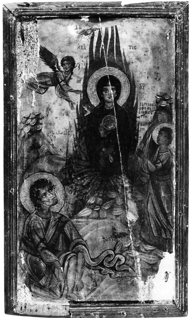
Fig. 6. Icon with the Virgin of the Bush and Moses, second half of the thirteenth century. Patriarchate of Jerusalem.

Identification of the other two icons, of Moses and St Catherine, with specific works known to us is not an easy task. The monastery contains a large number of images of Moses dating from before the mid-fourteenth century and we cannot begin to speculate which of them was originally located in the place mentioned by Niccolo. By contrast we know of only one icon of this date devoted exclusively to Catherine, the celebrated early thirteenth-century vita icon which could well have been placed on the door of the main church (Fig. 8) 62 . However Niccolo refers to a second image of St Catherine, in the sanctuary of the katholikon: in the