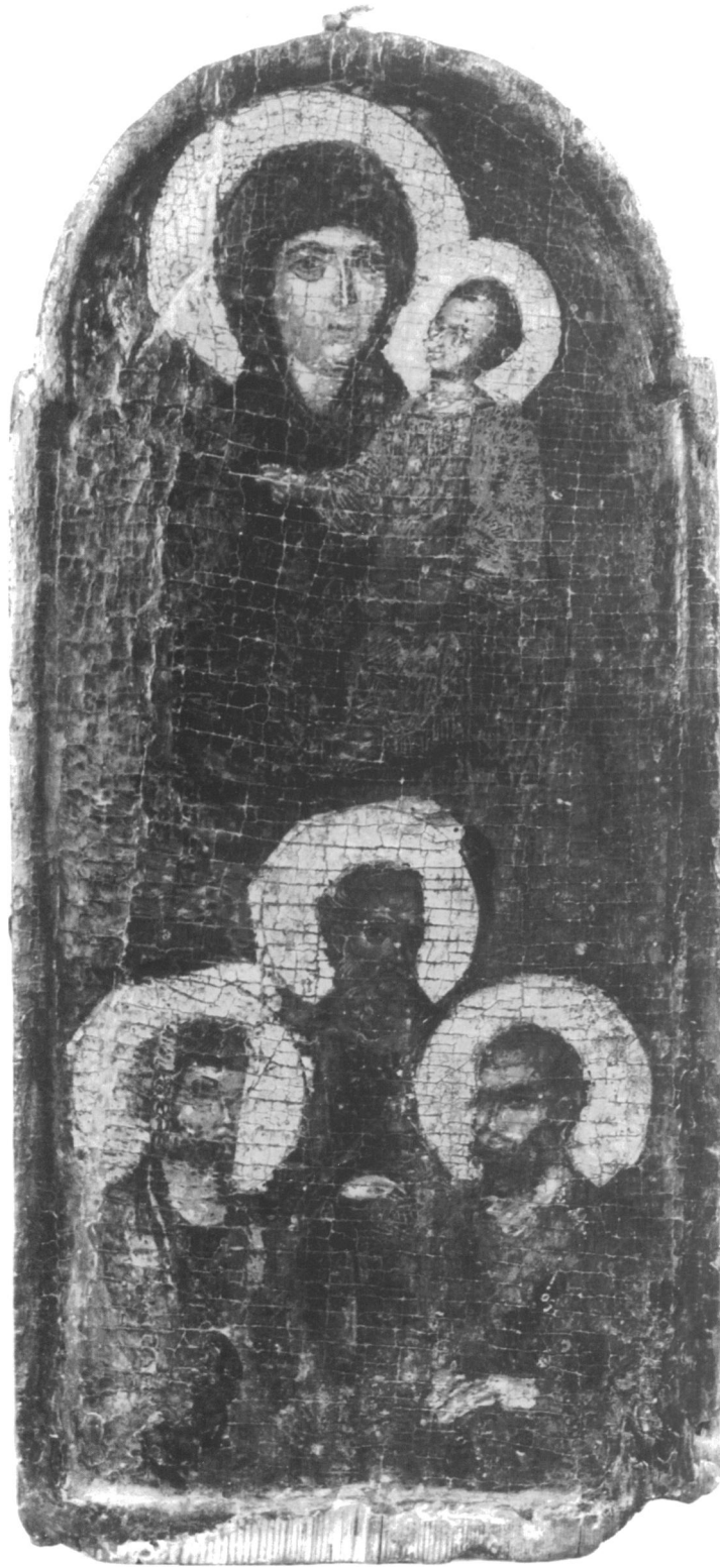
8 Icon of the Mother of God Zoodochos Pege, Byzantine Museum, Nicosia