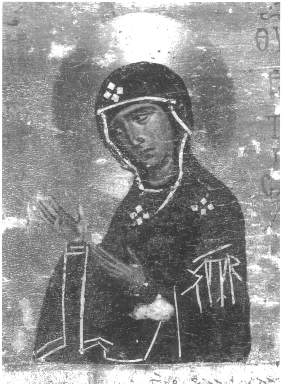
6 Icon with five icons of the Mother of God, detail: The Hagiosoritissa, Mount Sinai