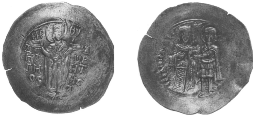
5 Aspron trachy nomisma of Theodore Doukas, with the Mother of God Hagiosoritissa on the obverse, Dumbarton Oaks