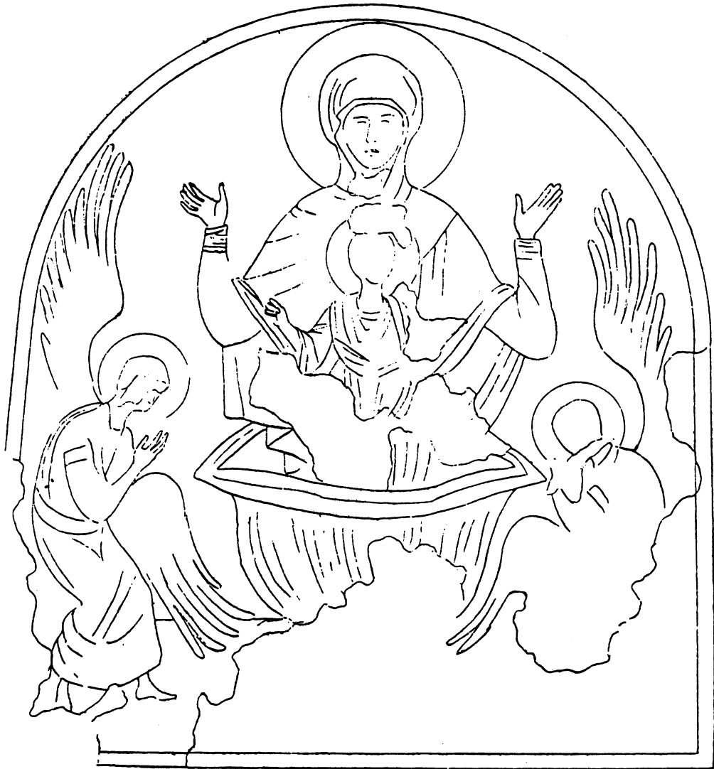
9 Hagioi Theodoroi , Mistra. Line drawing of fresco of the Mother of God Zoodochos Pege (after G. Millet, Monuments byzantins de Mistra [Paris, 1910], pl. 90.2)