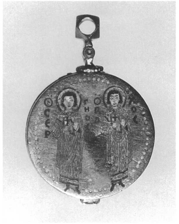
7a Enamel enkolpion with St. Demetrios, exterior, Dumbarton Oaks