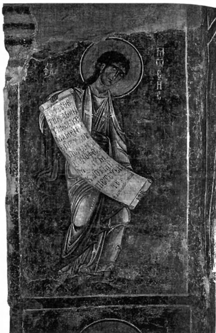
25. Wall painting from the parekklesion of Hagia Trias in the monastery of St John Chrysostomos, Koutsoventis, early 12th century

during his war against the Iranians, they may well have been made for him at Lapithos.