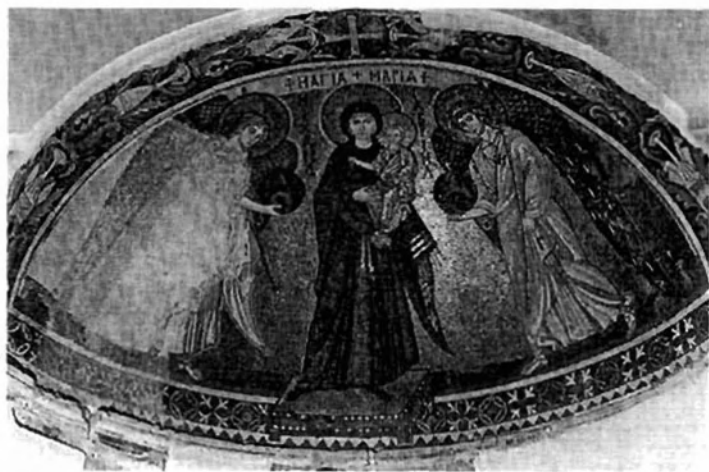
24. Mosaic showing the Virgin and Child flanked by the archangels Michael and Gabriel, from the apse of the Panagia Angeloktistos, Kiti, late 6th century AD

Only wall paintings and some icons survive from the period following the Byzantine reconquest of Cyprus (AD 965). The earliest wall paintings (11th century) are in Hagios Nikolaos tis Stegis and depict the Transfiguration , the Raising of Lazarus , the Entry into Jerusalem , the Ascension , the Deposition , the Entombment , the Dormition , Pentecost and some portraits of saints. There are also several 11th-century wall paintings in Hagios Antonios at Kellia. Of greater importance are the wall paintings of the late 11th century to the 12th, when the Byzantine governors of Cyprus and other officials erected numerous chapels and churches and brought painters from Constantinople to decorate them. The paintings in the parekklesion