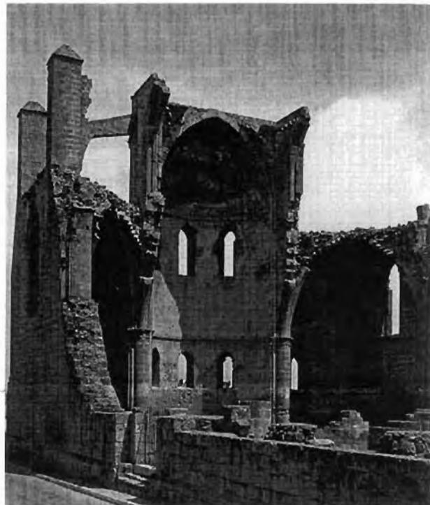
26. St George of the Greeks, Famagusta, 1360s; view from the north-west

The readoption of earlier motifs is symptomatic of the dramatic reformulation of architecture that emerged in the time of Peter I ( reg 1358–69). No royal buildings from his reign have survived in Nicosia or elsewhere, and the development is best illustrated by St George of the Greeks (ruined; see fig. 26), Famagusta. This was apparently the largest Orthodox church built during the 14th century and ranks as the most remarkable product of the Lusignan period in its adaptation of the Gothic style to Orthodox requirements in a dynamic and highly original manner. The church was built next to an earlier Orthodox shrine and laid out as a grand basilica without an ambulatory or transept. Recalling earlier traditions, the piers were reduced in diameter so as to resemble monolithic columns, and a large dome was placed over the central bay and half domes over the apses. The windows (especially in the apses) were made smaller to provide space for extensive narrative frescoes in the Byzantine manner. The interior and exterior were purged of carved ornament and the west front reduced to a plain wall pierced by three doors and a small oculus. Rib vaults and simple flying buttresses were effortlessly integrated into this scheme; the quality of masonry and command of vaulted space show that the lessons of Famagusta Cathedral had been fully assimilated. The building served as a model for later churches, notably