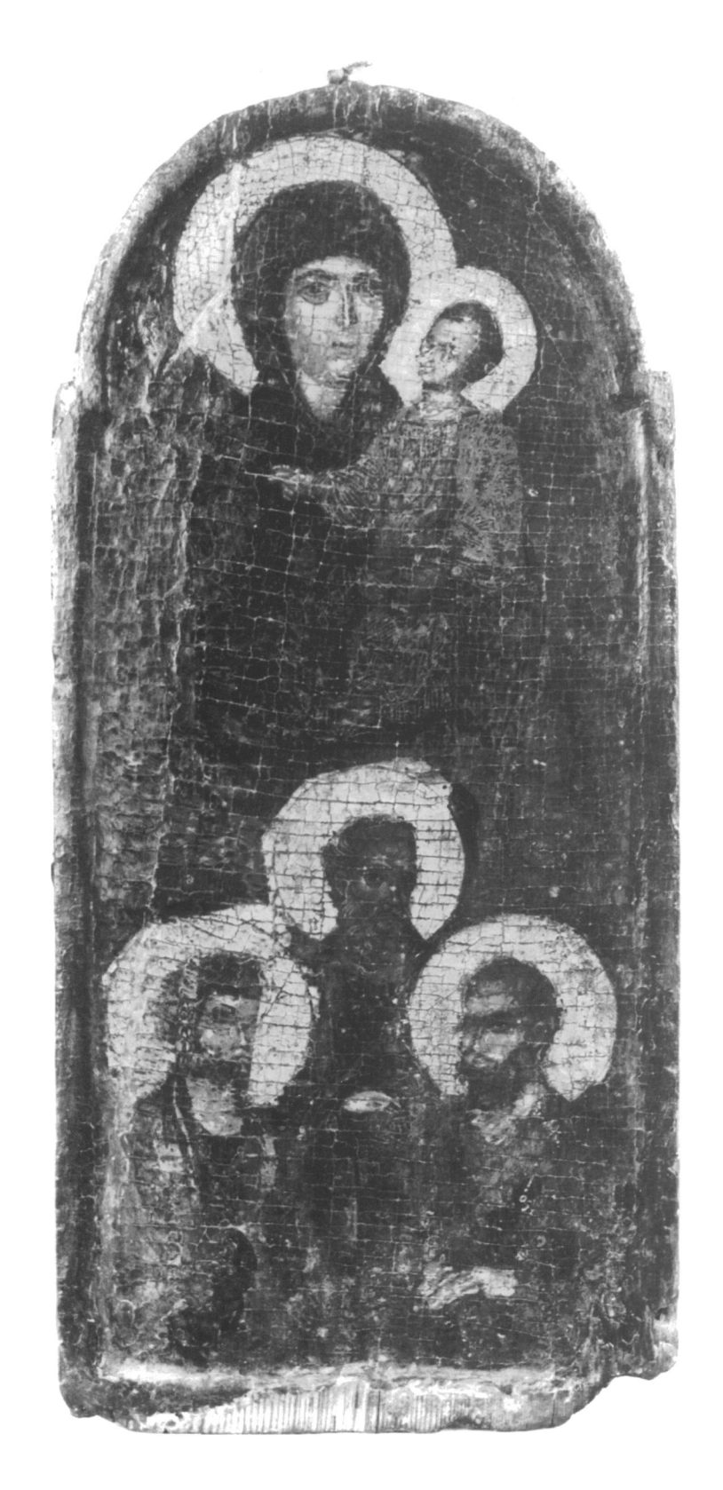
8 Icon of the Mother of God Zoodochos Pege, Byzantine Museum, Nicosia