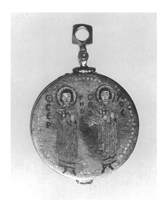
7a Enamel enkolpion with St. Demetrios, exterior, Dumbarton Oaks