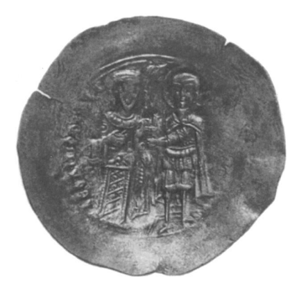
5 Aspron trachy nomisma of Theodore Doukas, with the Mother of God Hagiosoritissa on the obverse, Dumbarton Oaks