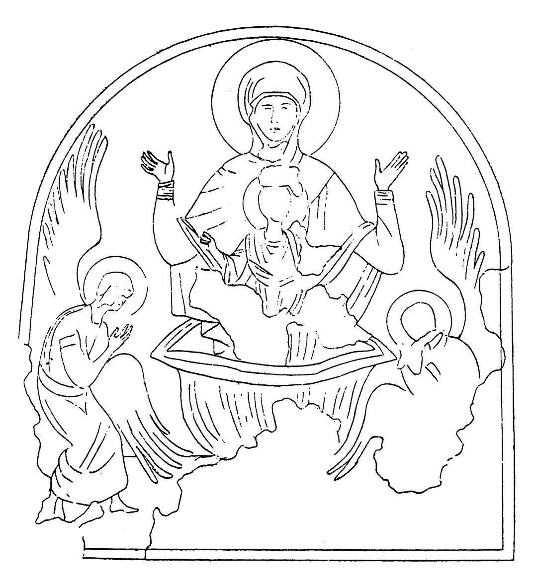
9 Hagioi Theodoroi, Mistra. Line drawing of fresco of the Mother of God Zoodochos Pege (after G. Millet, Monuments byzantins de Mistra [Paris,1910], pl. 90.2)