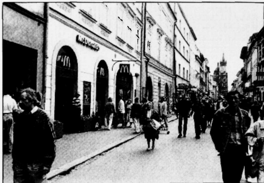
Street leading to central square, Kraków. (Jack Kugelmass)

Kraków's architectural treasures. None of this managed to disturb the intelligentsia's dominance of the city. Indeed, during the 1980s Nowa Huta became one of Solidarity's strongholds and the site of many strikes and protests.