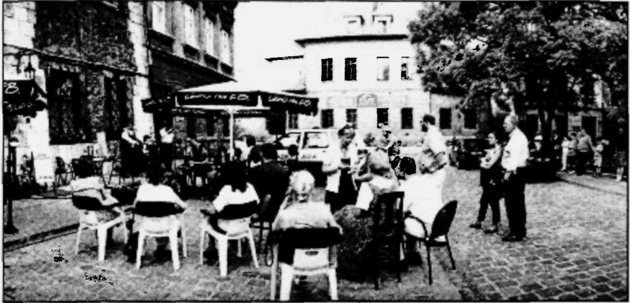
Klezmer concert at Noah's Café, Szeroka St.