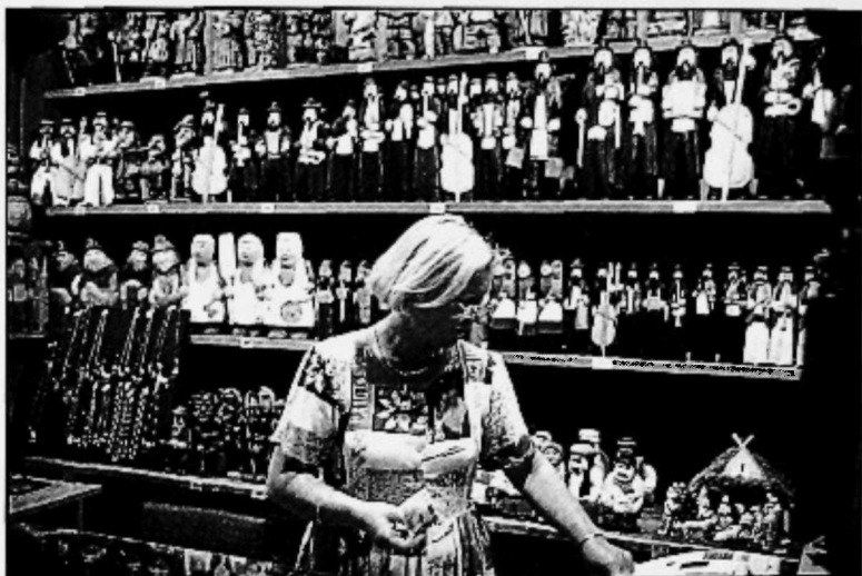
Souvenir stall in Kraków's sukiennica. (Jack Kugelmass)

The city's proximity to Auschwitz makes it a natural stop off point for anyone determined to reach the center of the unfathomable, a fact that colors even upscale plans for the city. As mentioned earlier, one such plan is to transform Kazimierz into Kraków's Rive Gauche. Several galleries have recently opened and exhibitions are part of the city's annual Jewish Culture Festival. At one (during the 1997 Festival), located in an upstairs large flat a young German artist displays an installation entitled "Postcards from the Front." The work consists of multiple postcard-size panels—facsimiles of photos and letters sent home by German soldiers on the eastern front including images of a visit by Hitler. The postcards are progressively obscured by black-and-white oil paint. The artist explains that they stand for the erasure of memory on the part of Germany's World War II generation.