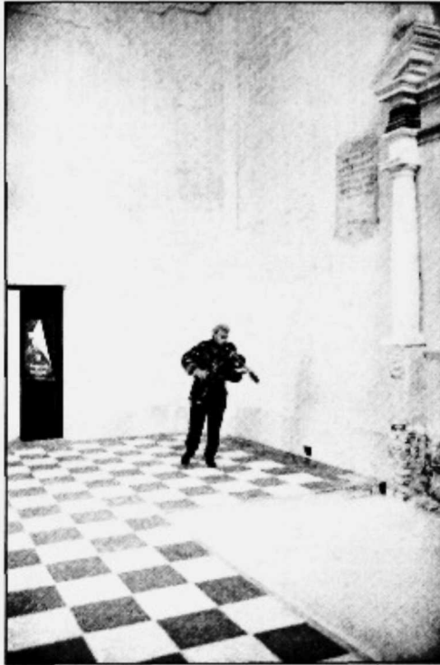
Recording Gebirtig in Izaak Synagogue (Jack Kugelmass)