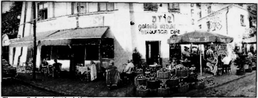
The two Cafe Ariels. (Jack Kugelmass)