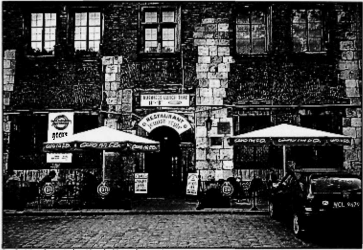
Cafe Noah's Ark. (Jack Kugelmass)