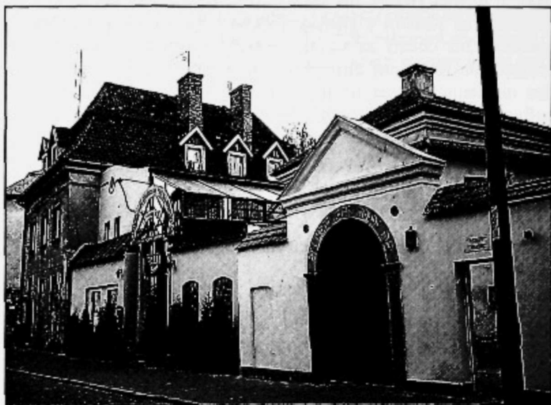
Remuh Synagogue (right) and Nissenbaum restaurant (left). (Jack Kugelmass)