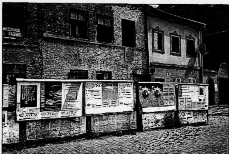
Private renovations, Szeroka St. (Jack Kugelmass)