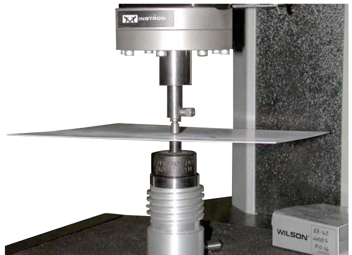
▲ Wilson® Rockwell®2000 series tester performing hardness test on sheet using diamond spot anvil.

Conversion charts are of value only as a guide. Rockwell hardness numbers should be reported on the same scale on which the actual test was made (this is a direct reading as opposed to a converted reading). In the event it is absolutely necessary to report converted values, the fact that the numbers are converted should be indicated. Comparison between different hardness scales on a conversion chart does not apply if the actual test was improperly made. For example, if sheet metal is so thin that tests made on the Rockwell B scale show bulges on the underside of the sheet, then values of Rockwell 30 T cannot be obtained by merely carrying those incorrect B scale values to the chart but can only be found by actually making a test on the 30 T scale. If an accurate 30 T scale reading is determined by test, the conversion chart may be referred to for the equivalent B scale hardness numbers although the material is too thin for an accurate B scale test. Proper use of the chart requires a valid and proper reading.