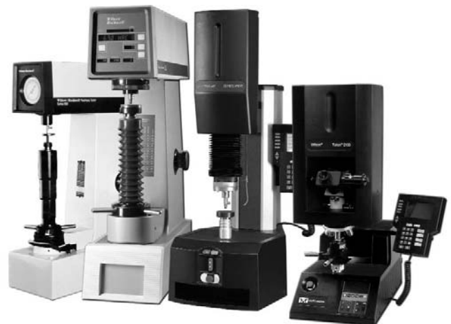
▲ Hardness family.

Bench model testers are available in a wide range of vertical capacities: the smallest is approximately 6 inches and the largest as great as 14 inches. The throat depth for most models is approximately 5¼ inches. In choosing the vertical capacity, not only must the size of the part be considered, but also the size of the anvil or supporting fixture.