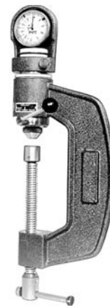
▲ Wilson Instruments portable model M3.