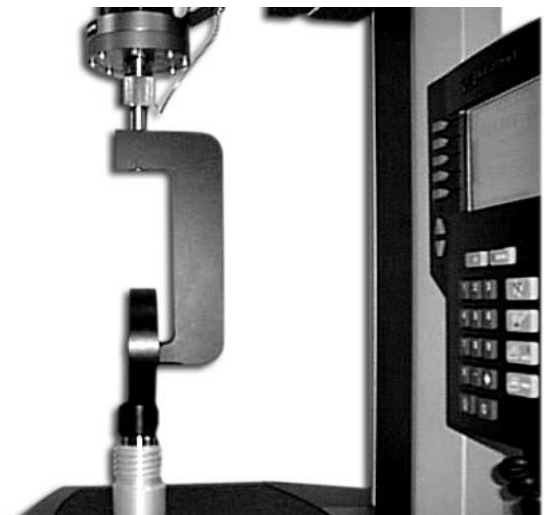
▲ Gooseneck extension for ease of internal testing.

Tubes and hollow pieces must be supported by a mandrel to ensure rigidity under the test loads. This will prevent the tube from deforming under the major load, thus causing a lower hardness reading.