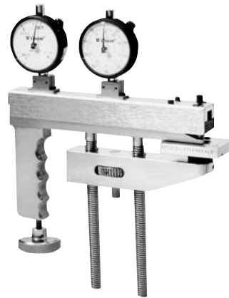
▲ Wilson Instruments mobile model M51.

The Rockwell tester, while a rugged piece of equipment, is also a precision instrument with many features suitable for production testing. To utilize this instrument to its full potential, consideration must be given to the factors governing selection of the appropriate scale as well as the curvature of the specimen and the importance of adequate support under test. With all limiting factors taken into account and with properly designed equipment in good calibration, the Rockwell test can be a versatile procedure capable of measuring small differences in hardness.