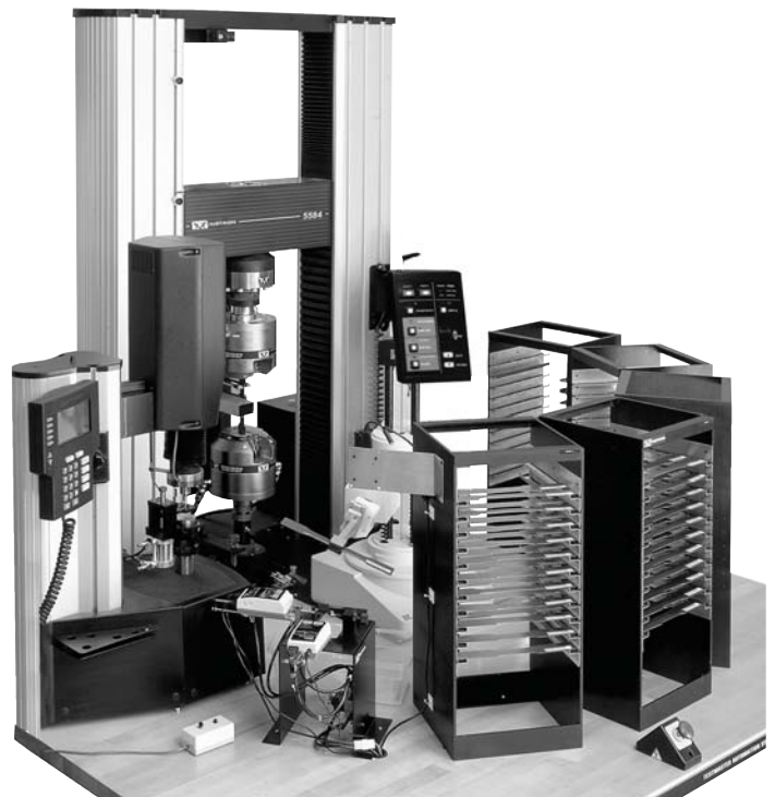
▲ Rockwell series 2000 tester integrated with Instron® universal test system designed for automatic loading and testing with a robot.

The standard Rockwell test requires approximately three to six seconds to complete the loading, testing and unloading cycle. The custom high-speed hardness tester can be designed to require less than one second to go through the same cycle. There is considerably less time for plastic flow of the sample during the test. This difference in time can produce small but measurable differences in depth of penetration between the standard Rockwell test and the high-speed test. Therefore, the manufacturer cannot claim that the high-speed tester performs a true Rockwell test, but it does produce a test that gives similar results. For ease of application, the high-speed tester is calibrated using standard Rockwell test blocks.