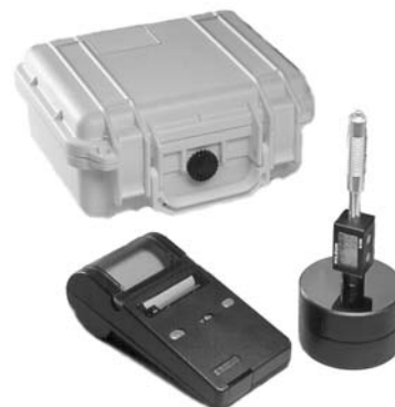
▲ Wilson Instruments model M-250 Portable LEEB type hardness tester with printer.