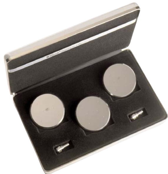
▲ Rockwell calibration set.