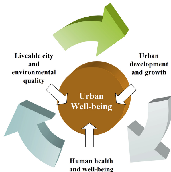
Fig. 3. Urban well-being and sustainable development.

should be a part of the overall development plan. This issue is of global interest, because many countries are in a process of rapid urbanization, and urban greening and urban forestry have an important role to play in the process of promoting quality of life and improving environmental quality (Skärback, 2007). In the case of shrinking cities, urban agriculture can be used as a policy to increase the quality of life for the remaining population (Panagopoulos et al., 2015).